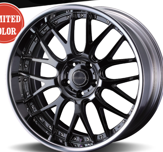
SUPER DEEP BLACK CHROME 20inch REVERSE RIM・Curl Flange